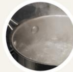
BOIL WATER NOTICES

CodeRED will only be used for emergency situations to keep you informed. These are just a few examples of why we may use CodeRED.