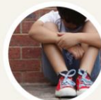
MISSING PERSON CASES